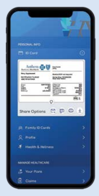
VIEW YOUR ID CARDS